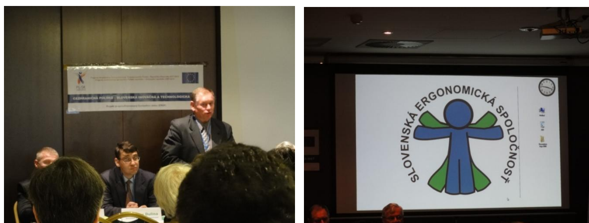
Figure 1 and 2: Ergonomics 2010 opening Ceremony

The international conference Ergonomics 2010 focused on advanced methods in ergonomics was held on the 24. th and 25. th November in Žilina, Slovak Republic. The conference was organized by the Slovak Ergonomic Association and this year carried a subtitle Progressive methods in Ergonomics.